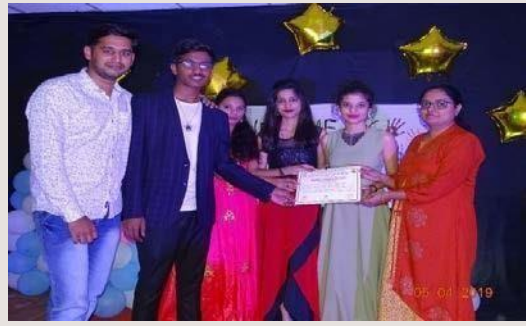
Farewell Party 2019.